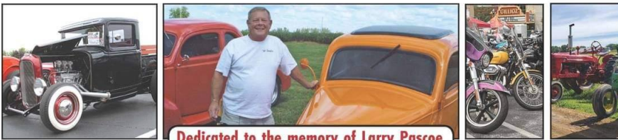
Dedicated to the memory of Larry Pascoe