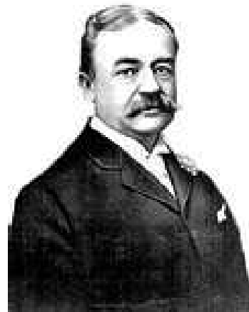
Aaron Montgomery Ward