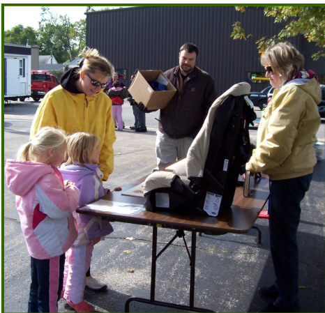
Safety Day in Baroda