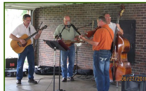
UpHill Climb - Music in the Park