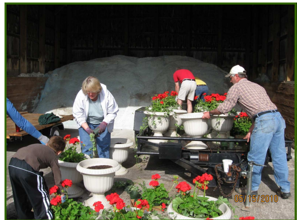
First Street Planters