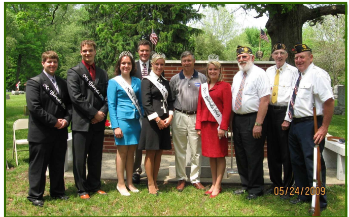
Memorial Day Service at Ruggles Cemetary